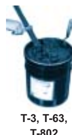
T-3, T-63, T-802