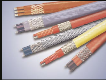
Electric Heating Cables